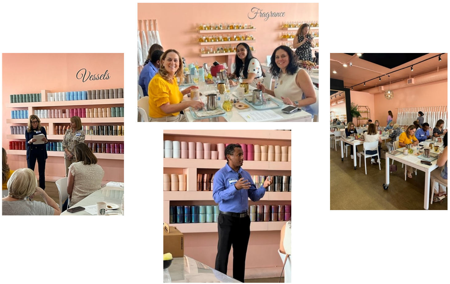
Board Members attending meeting and hearing from speakers at CandleLand Miami.